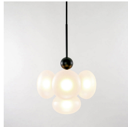
Shown in matte black / frosted

The Allure II Cluster Pendant features beautifully layered clusters of mold blown mushroom shaped frosted glass shades arranged in a spiral shaped pattern are linked together by an elegant endoskeleton of brass components that both begins and ends with a hand finished brass sphere. Place where statement lighting is needed most. Finished in Satin Brass, Matte Black, Polished Nickel or Natural Brass. Available in three sizes. UL listed.