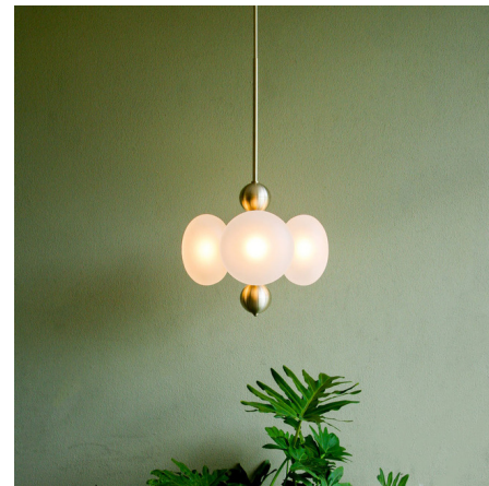
Shown in natural brass / frosted

The Allure Cluster Pendant features beautifully layered clusters of mold blown mushroom shaped frosted glass shades arranged in a spiral shaped pattern are linked together by an elegant endoskeleton of brass components that both begins and ends with a hand finished brass sphere. Place where statement lighting is needed most. Finished in Satin Brass, Matte Black, Polished Nickel or Natural Brass. Available in three sizes. UL listed.