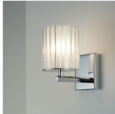
Shown in polished chrome / frosted

The Flute Wall Light features a cylindrical ribbed Frosted glass shade set against a square backplate for a sleek, sophisticated look. Available in two sizes with a Polished Chrome, Polished Nickel, Polished Gold, or Brushed Nickel. Polished Nickel shown with US backplate. All finishes ship with extended US backplate. NOTE: Larger size is NOT available with a Brushed Nickel finish.