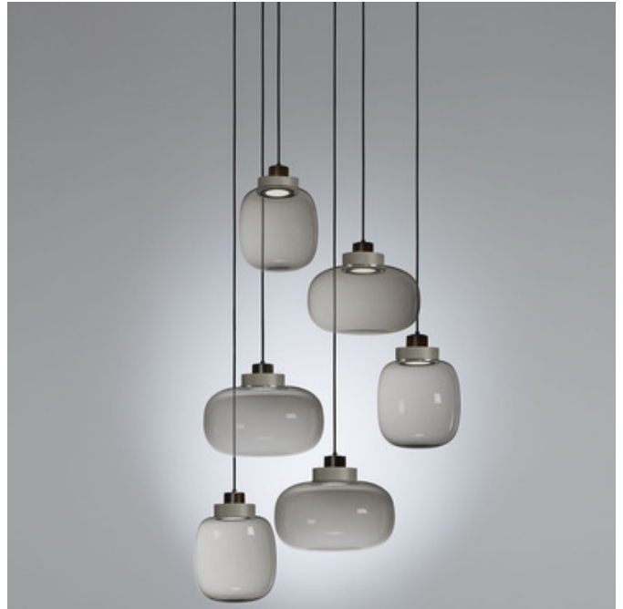
Shown in: Gray / Smoke

The Legier Chandelier is inspired by the classical shapes of Murano diffuser. Its elegant spherical profile is apparently fragile yet very robust and functional. Place where statement lighting is needed most. The Legier can have the connection finished in Black complemented with a Copper, Brass or Gray ring, while the diffuser is made by blown glass and finished in Opal or Smoked glass with harmonious and decorative shapes.