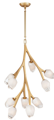
Shown in natural aged brass / frosted

PRODUCT DIMENSIONS . . . . . Downrods Included: 1 + 6", 3 + 12" LAMP LIFE . . . . . 25000 hours COLOR RENDERING . . . . . 80 CRI LAMP COLOR . . . . . 3000K LUMENS/WATT . . . . . 1,000.00 LUMINOUS FLUX . . . . . 4000 lumens