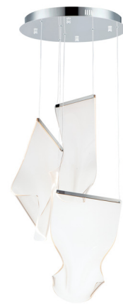
Shown in polished chrome / clear patterned acrylic

PRODUCT DIMENSIONS . . . . . Overall Height: 18.5in Min. - 135.25in Max. LAMP LIFE . . . . . 30000 hours COLOR RENDERING . . . . . 80 CRI LAMP COLOR . . . . . 3000K LUMENS/WATT . . . . . 200.00 LUMINOUS FLUX . . . . . 600 lumens