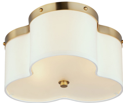
Shown in satin brass / off white

The Clover Flush Mount features a classic scalloped fabric shade with decorative metal trim and rivets. Using an Off-White linen fabric shade, and accented with Aged Brass metalwork, this design is timeless and elegant.