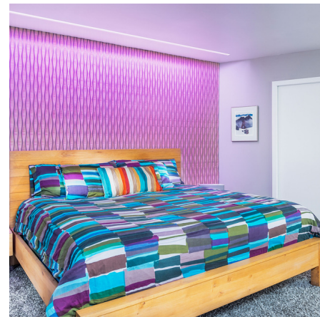
Shown in satin aluminum

LUMENS/WATT . . . . . 42.00 LUMINOUS FLUX . . . . . 210 lumens