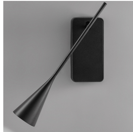
Shown in ebony black

The Skybell Wall Sconce features a clean and simple design that strips the light to its basic necessities that maintains an elegant and discreet look. The arm of the lamp is adjustable and can stick out up to 35 degrees from the base and rotate 210 degrees around. Available with a Black finish. ETL and CE listed. NOTE: This fixture is designed to be mounted on a 2 inch x 4 inch switch box and will not cover a standard 4 inch junction box.