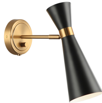
Shown in aged gold brass / black

The Blaze Wall Sconce adds both form and function to your interior space. The smooth metal shade casts warm shadows across your room and can be directed where you need light. Available with a Single straight arm or Double adjustable arm.