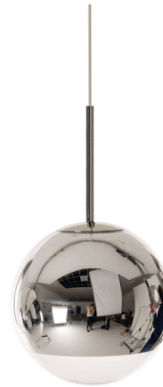
Shown in black / mirror