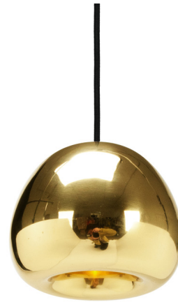
Shown in matte black / brass

PRODUCT DIMENSIONS . . . . . Cable Length: 98.4" Black Braided COLOR RENDERING . . . . . 94 CRI LAMP COLOR . . . . . 3000K LUMENS/WATT . . . . . 106.67 LUMINOUS FLUX . . . . . 800 lumens