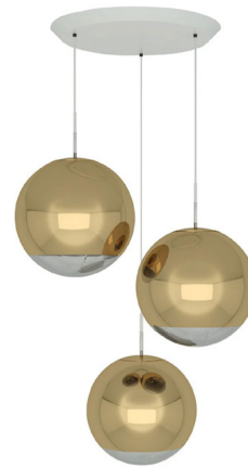
Shown in white / gold