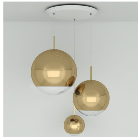
Shown in white / gold