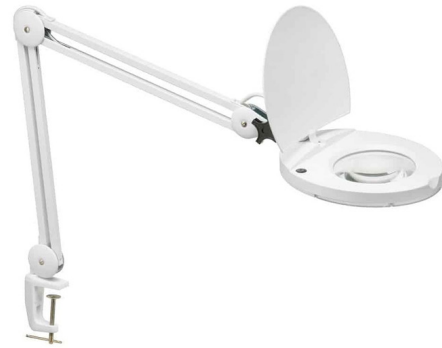
Shown in white / clear