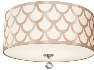
Shown in polished chrome / gold

The Hannah Flush Mount Ceiling Light features metal and fabric construction.