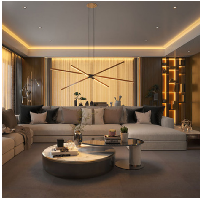
Shown in: Satin Nickel / Wood Cherry

MIYO Make-It-Your-Own Pix Sticks Tie Stix Suspension system allows you to become the lighting designer. Mix & match your channel lengths or keep them all the same in configurations of 2, 3, 4, 5, 6, 7 or 9-light options. Available in increments from 39 to 96 inch, 5 or 7 watts per foot, and multiple wood and metal channel finish options. Offered in a variety of color temperature options including two Warm Dim options of 2700K (27D) or 3000K (30D) that dim down to 2000K. Includes two 12 foot adjustable aircraft cables per channel length. Requires a canopy and Universal (UNI), electronic low voltage (ELV), 0-10V or Lutron Hi-Lume power supply. 5 year pro-rated warranty. ETL listed. Suitable for damp locations. Title 24 compliant when used with Universal (UNI) power supply. Product is built to order. NOTE: A 24VDC REMOTE POWER SUPPLY AND MULTI-LIGHT CANOPY ARE REQUIRED AND SOLD SEPARATELY. Canopy and Hardware Finishes: Satin Black, Antique Bronze, Chrome, Satin Nickel and White. Channel Finishes: Satin Black, Chrome (available up to 84 inch length), Satin Nickel, White, Satin Brass, Maple, Walnut, Cherry, White Oak and Wood Espresso.