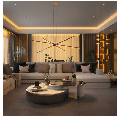
Shown in satin nickel / wood cherry