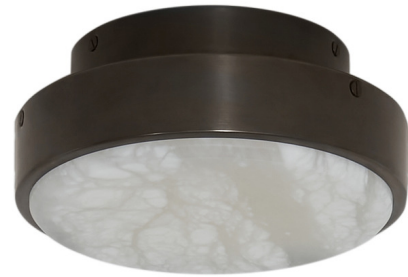
Shown in bronze / honed alabaster

The Anvers Surface Wall/Ceiling Mount is inspired by the plains of a Flemish Landscape. The low profile offers a stunning silhouette and clean elegance with the Honed Alabaster stone diffuser. Available as flush mount or semi-flush mount with canopy. ADA compliant when used on the wall.