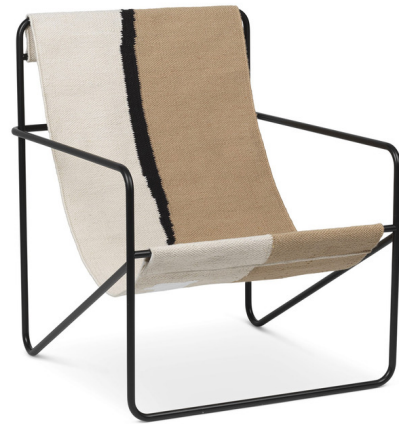
Shown in black / soil

The Desert Lounge Chair features a modern and minimalist design crafted from powder coated steel tubes that make up the structure of the chair and an interchangeable woven textile seat that is made from recycled plastics. Available with a Black or Cashmere frame complemented by a textile pattern. Suitable for indoor or outdoor use. The seat can be removed and washed on a gentle wash cycle in your washing machine.