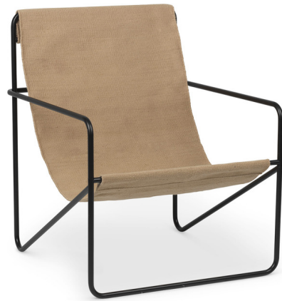
Shown in black / sand

The Desert Lounge Chair features a modern and minimalist design crafted from powder coated steel tubes that make up the structure of the chair and an interchangeable woven textile seat that is made from recycled plastics. Available with a Black or Cashmere frame complemented by a textile pattern. Suitable for indoor or outdoor use. The seat can be removed and washed on a gentle wash cycle in your washing machine.