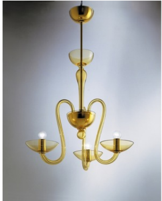
Shown in: Polished Gold / Amber

The jellyfish-inspired Menegario Small Chandelier is a handmade glass chandelier in Amber or Red glass with a Polished Gold frame or Clear or Blue glass with a Polished Chrome frame.