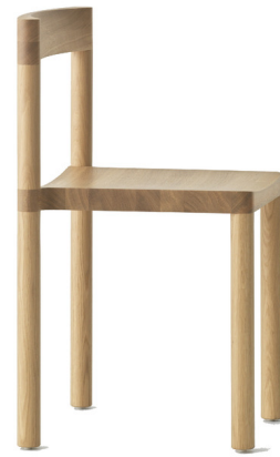
Shown in natural oak

The Pier Chair, designed by Leonard Kadid, takes its inspiration by the thick, straight cylindrical pillars of pier structures. The certified F.S.C. solid oak chair is made using mortise and tenon joints, giving this classic piece sustained durability. These chairs can stack on top of each other when not in use.