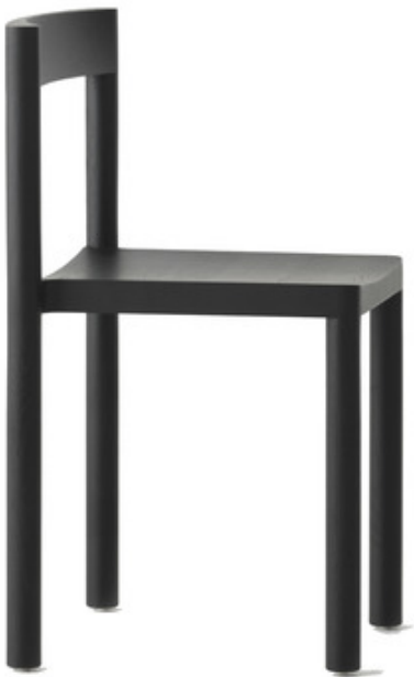
Shown in: Black Oak

The Pier Chair, designed by Leonard Kadid, takes its inspiration by the thick, straight cylindrical pillars of pier structures. The certified F.S.C. solid oak chair is made using mortise and tenon joints, giving this classic piece sustained durability. These chairs can stack on top of each other when not in use.