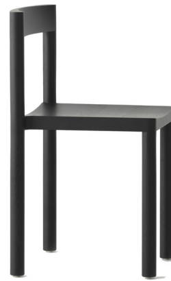
Shown in black oak

The Pier Chair, designed by Leonard Kadid, takes its inspiration by the thick, straight cylindrical pillars of pier structures. The certified F.S.C. solid oak chair is made using mortise and tenon joints, giving this classic piece sustained durability. These chairs can stack on top of each other when not in use.