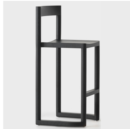
Shown in black oak

The Pier Bar Stool, designed by Leonard Kadid, takes its inspiration by the thick, straight cylindrical pillars of pier structures. The certified F.S.C. solid oak stool is made using mortise and tenon joints, giving this classic piece sustained durability. A foot rest completes the look.