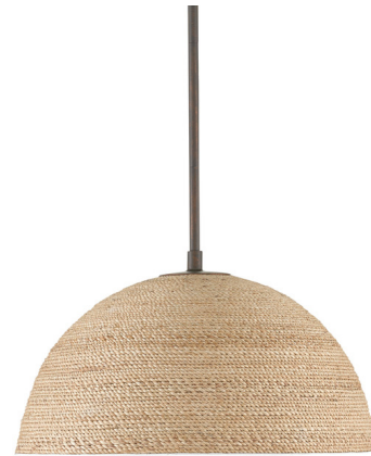
Shown in bronze gold / abaca rope