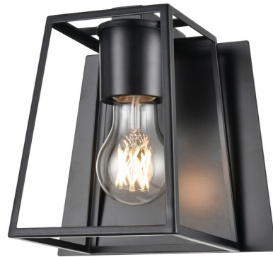
Shown in ebony / ebony

The Cape Breton Wall Sconce is a true statement piece with an open cage structure that gives the fixture a modern look.