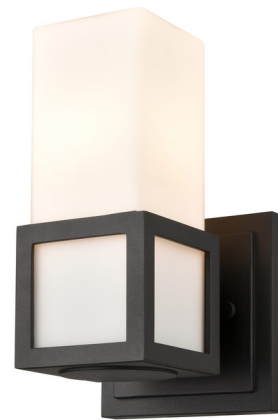
Shown in black / opal

The Chicago Wall Sconce features a rigid and cubic half opal glass diffuser that is attached to the metal frame with a cube outline adding to the modern and clean look of the fixture. Available in two sizes.