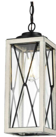
Shown in birchwood / black / clear

The County Fair Outdoor Pendant has traditional styling with a rustic twist. Features Clear glass panels with three finish options available. ETL listed. Suitable for wet locations.