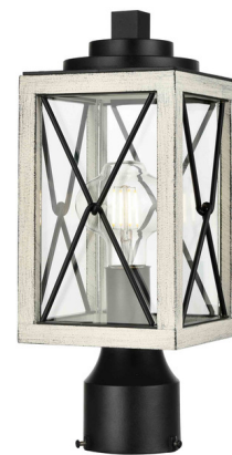
Shown in birchwood / black / clear

The County Fair Post Mount has traditional styling with a rustic twist. Features Clear glass panels with three finish options available. Mounts to 4 inch round post, not included. ETL listed. Suitable for wet locations.