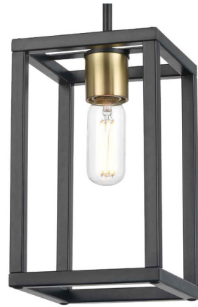
Shown in graphite / graphite

PRODUCT DIMENSIONS . . . . Downrods: (1) 15 inch, (1) 12 inch, (1) 9 inch, (1) 4 inch