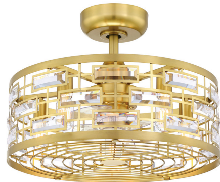
Shown in brushed satin brass / clear

PRODUCT DIMENSIONS . . . . . Downrods: (1) - 4.5in. COLOR RENDERING . . . . . 90 CRI LAMP COLOR . . . . . 2700K LUMENS/WATT . . . . . 83.33 LUMINOUS FLUX . . . . . 500 lumens