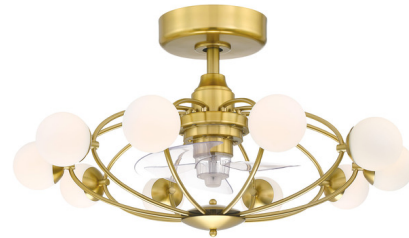
Shown in brushed satin brass / clear

COLOR RENDERING . . . . . 90 CRI LAMP COLOR . . . . . 3000K LUMENS/WATT . . . . . 842.11 LUMINOUS FLUX . . . . . 3200 lumens