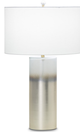
Shown in champagne / off white

The Barrett Table Lamp features a hand made ombre pattern that gracefully moves from Champagne to White as it rises up the body of the lamp which is topped with an Off-White cotton drum shade. Includes a 3-way socket switch. UL listed.