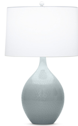
Shown in grey-blue / off white

The Malone Table Lamp features a mouth blown glass body that has a Grey-Blue finish and a delicate hand made textural element across the surface. Available with an Off-White cotton shade. Includes a 3-way socket switch. UL listed.