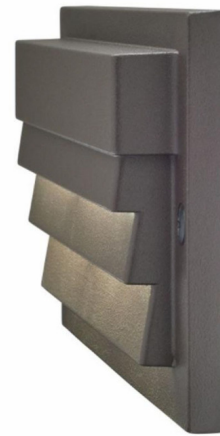
Shown in centennial brass