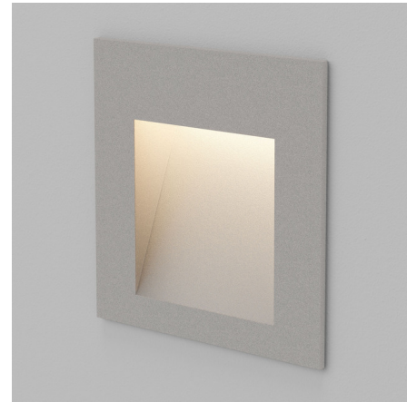
Shown in satin silver powdercoat