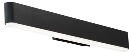
Shown in black / white