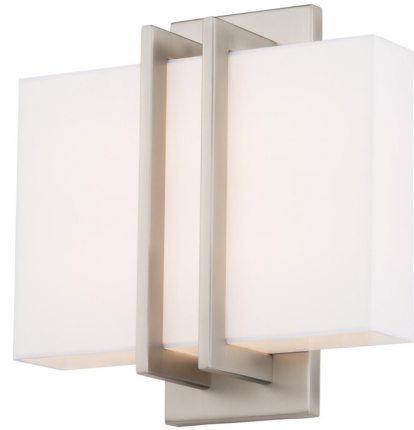
Shown in brushed nickel / white

The Downton Wall Sconce features a clean and simple finish that has a harmonious combination of materials from the crisp White fabric shade to the architectural styled metal structure creating a refreshing design. Each fixture comes preset with your choice of color temperature that can be changed during installation through the use of the incorporated switch. Can be mounted horizontally or vertically.