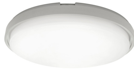
Shown in titanium / white

The Zenith Ceiling Light features a clean and simple design with a round low-profile shape giving it an unassuming look that is packed with the latest LED technology. This fixture comes with a preset color temperature, but has the ability to be changed during installation through the use of the on-board CCT selection switch. Options include a standard fixture and a fixture with a battery backup that provides the fixture with 90 minutes of lighting should the power go out.