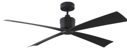
Shown in midnight black / midnight black