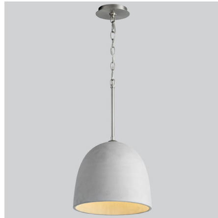
Shown in satin nickel / grey

The Dune Pendant features a smooth Concrete dome shade hanging from a Steel frame to bring an industrial aesthetic to any contemporary space.