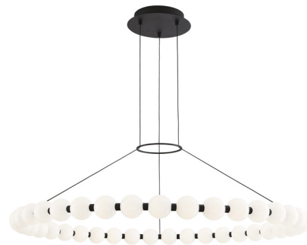
Shown in nightshade black / milk

LAMP LIFE . . . . . 50000 hours COLOR RENDERING . . . . . 90 CRI LAMP COLOR . . . . . 2700K LUMENS/WATT . . . . . 63.18 LUMINOUS FLUX . . . . . 3159 lumens