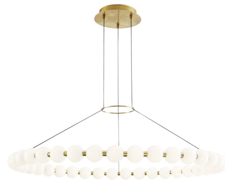
Shown in natural brass / milk

Inspired by a string of pearls, the Orbet Chandelier is a ring of shiny milk glass orbs accented with metal spacers. Its soft diffused aesthetic adds a sense of elegance to dining rooms and foyers or hospitality settings. The thin metal ring that gathers the suspension cables is included, and the fixture can be styled with or without it. Includes a universal 120-277V driver, dimmable with most ELV and TRIAC dimmers. The Natural Brass is a living finish that will patina and warm with age, adding richness. If it gets an uneven patina or spots, a brass cleaner can restore the finish.