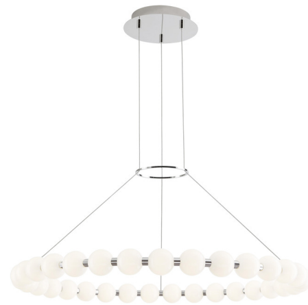
Shown in polished nickel / milk

Inspired by a string of pearls, the Orbet Chandelier is a ring of shiny milk glass orbs accented with metal spacers. Its soft diffused aesthetic adds a sense of elegance to dining rooms and foyers or hospitality settings. The thin metal ring that gathers the suspension cables is included, and the fixture can be styled with or without it. Includes a universal 120-277V driver, dimmable with most ELV and TRIAC dimmers. The Natural Brass is a living finish that will patina and warm with age, adding richness. If it gets an uneven patina or spots, a brass cleaner can restore the finish.