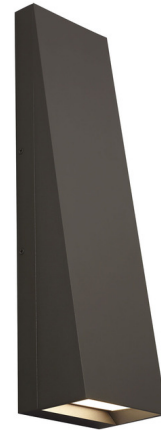
Shown in bronze

The Pitch Outdoor Wall Sconce features Stainless Steel hardware and aluminum construction with three powder coat finish options. Available in two sizes.