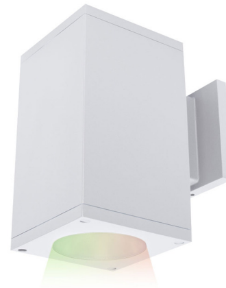
Shown in white / clear

LAMP LIFE . . . . . 80000 hours BEAM ANGLE . . . . . 15° COLOR RENDERING . . . . . 90 CRI LAMP COLOR . . . . . RGB+White