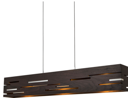
Shown in brushed aluminum / dark stained walnut

The Aeris Linear Pendant features organic and often wild swirls of walnut grains and the addition of rigorous slits and inlays that allow the light within to give of a beautiful and rich glow that creates a juxtaposition between the light and components of the fixture. Available in two sizes with a Brushed Aluminum or Black Anodized finish complemented by an Oiled Walnut or Dark Stained Walnut shade. 2700K and 3500K color temperature options available. Suitable for sloped ceilings. UL listed. Made in USA.