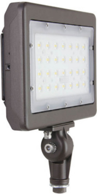
Shown in: Bronze

The Slim Flood Light features a die-cast aluminum housing with corrosion resistant powder coat paint and UV resistant polycarbonate lens. Available in two lumen options in CCT selectable color temperature (3000K/4000K/5000K). Wide flood beam angle. A 3-pin NEMA twist lock photocell receptacle with shorting cap is included as standard. Offered in yoke mount, slipfitter knuckle, or knuckle with .5 inch thread mounting options.