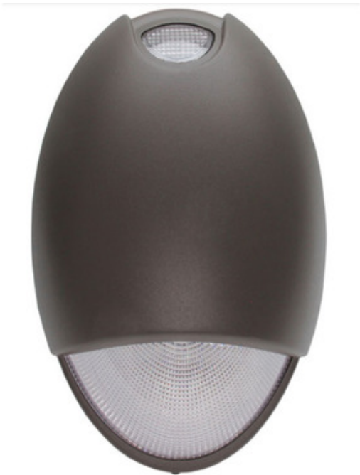
Shown in: Bronze

The Guardmax Emergency Wall Pack features a low profile architectural design constructed of die-cast aluminum housing with corrosion resistant powder coat finish with polycarbonate diffuser. Offered in two battery backup options with 120-277V photocell included as standard. 90 minutes emergency lighting with self diagnostic function and 4.8V maintenance free NiCad battery included. Equivalent to a 42 watt CFL. Field selectable wiring allows AC operation to be controlled using a wall switch, photocell, or other switching mechanism. 2 LEDs = 1,275 lumens in AC mode, 350 lumens in battery mode. Field-selectable wiring allows AC operation to be controlled using either a wall switch, photocell or other switching mechanism. Mounts to recessed junction box.