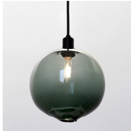
Shown in dark oxidized / transparent smoke

The Drape Pendant features a minimalist design using a unique handblown glass shade suspended on a fabric-wrapped cord. The 4.5 and 7 inch sizes feature a spherical shape, while the 6 inch size features a flattened, rounded shape. All sizes are available in dipped glass with a mouth where the glassblower's pipe was separated from the glass, or textured glass with a frosted finish and subtle ridged texture. 5 inch diameter canopy. Note: Cord length is field adjustable. Longer lengths available for an additional fee.